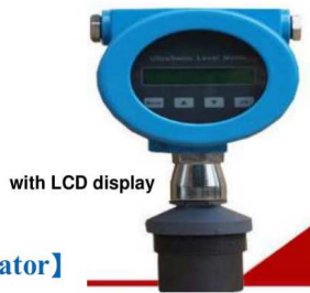
with LCD display

ultrasonic level transmitter is a combination of ultrasonic sensor, temperature sensor, ultrasonic servo circuit and transmitter circuit. It uses SMD components and ASC chip, which makes the circuit compact and concise. The circuit board is plated and has high stability and long-term reliability. Meanwhile, the shell uses NLEPF synthetic materials with sturdy texture and good acoustic property. The transducer can be used in most working condition sites. While fixing it on the liquid wall or instrument housing, there is no need tools such as screws, but a 68mm hole. It has the features of stabilization, easy installation and disassembly.